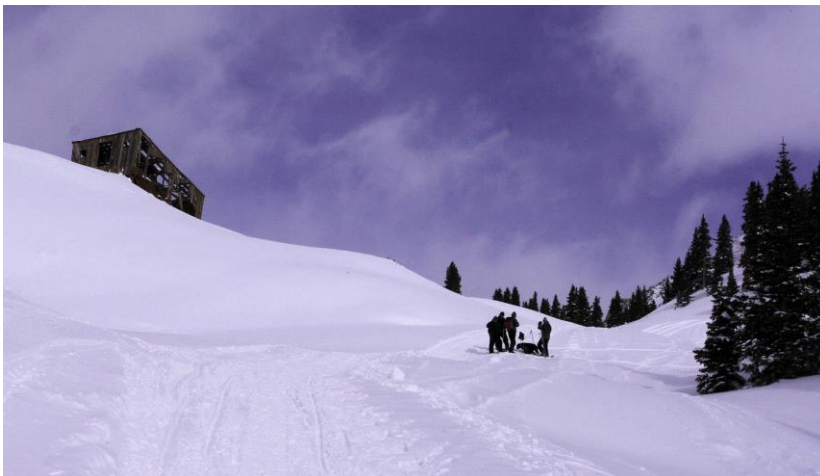
Skiers stop near one of the many old mine buildings-small.JPG

another road junction at mile 0.9. Here County Road 14 turns right (south) and is well-signed to the St. Paul Lodge and Mountain Belle Cabin. Throughout this area you'll see some of the many old mine buildings still standing.