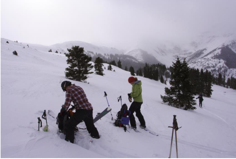
Time to shed the climbing skins and head down-small.JPG