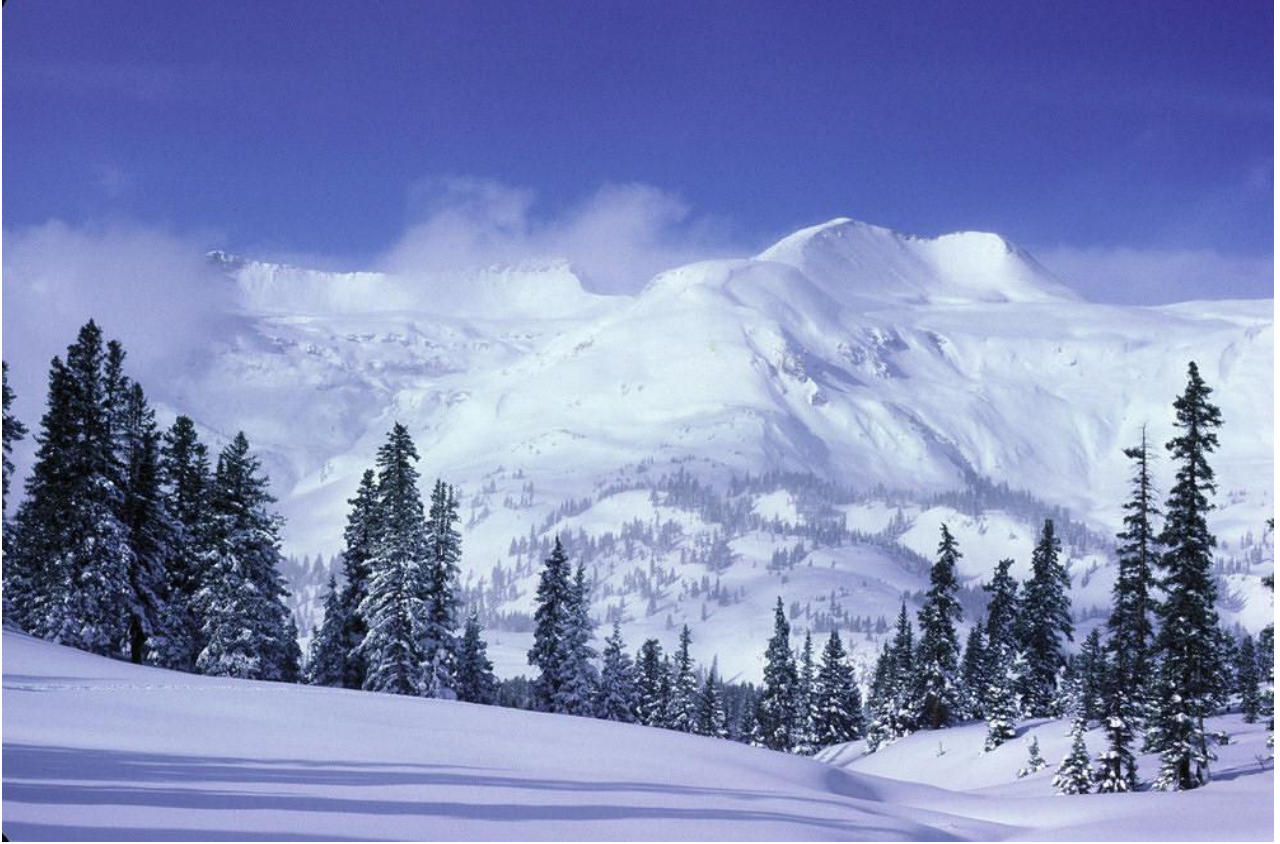
Red Mountain Pass provides spectacular views in addition to many acres of outstanding backcountry skiing-small.jpg

Ever since first experiencing the tremendous backcountry skiing available in the vicinity of Red Mountain Pass, back in the early 1980's, I've tried to make an annual pilgrimage to this area. So far I haven't been disappointed. On each occasion my friends and I have found amazing powder snow conditions. Whether skiing the gentle slopes high on the flanks of McMillan Peak or the challenging tree runs in US Basin we have enjoyed memorable descents that demand that we skin up again and repeat. On those occasions when the snow above treeline is windpacked, there are plenty of glades lower down that tend to hold good snow.