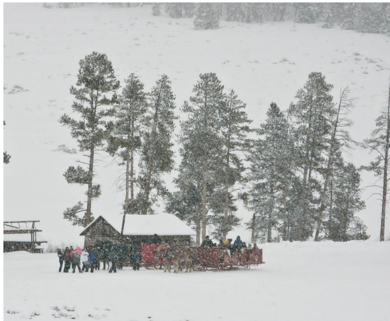
Keystone Ranch Sleigh ride-small.jpg

Retrace your tracks to return to your vehicle.