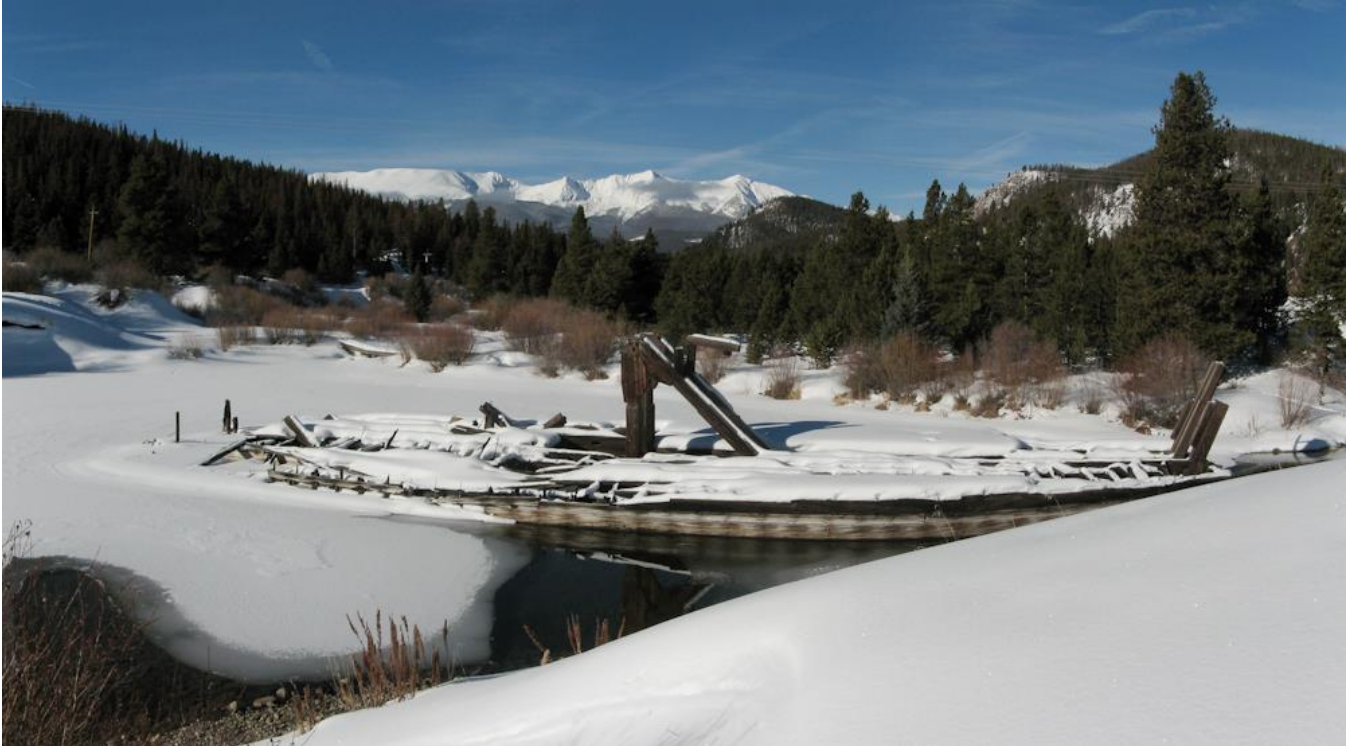
An old gold dredge near the Horseshoe Gulch trailhead - small.jpg

The country north of the Swan River, just outside the town of Breckenridge, is an area of rolling terrain ideally suited to cross country skiing. To protect the elk habitat, motorized vehicles aren't allowed, so you should enjoy a peaceful outing. Tree-covered hills and open valleys are criss-crossed by a multitude of unpaved roads, making the area a popular destination for locals. A word of caution: most of the trails are unmarked and require good orienteering skills, especially for loop tours.