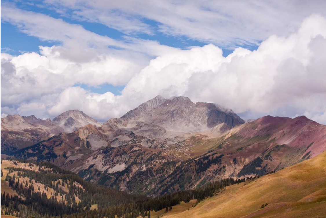
Dramatic clouds over Snowmass Mountain and Hagerman Peak - small.jpg

This week's hike is fast becoming an autumn favorite. The loop hike visits three high passes which afford spectacular views of three distinctly different valleys, not to mention the rugged peaks ringing those valleys. On a Labor Day hike recently the alpine tundra was already turning to a sea of yellow, red and green, contrasting sharply with peaks of red and white.