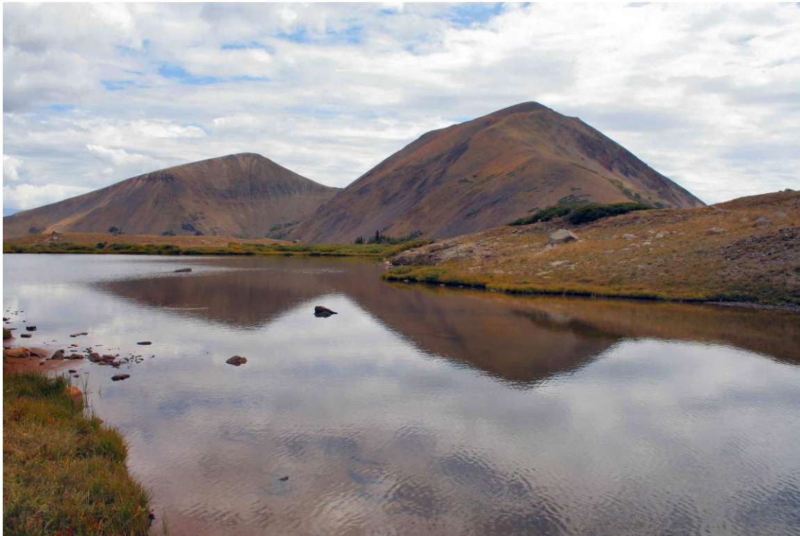
Figure 1 The rounded summits of the Never Summer Range, seen from the American Lakes

USGS Quad: Clark Peak, CO, Chambers Lake, CO (marginally), Fall River Pass, CO, Mount Richthofen, CO