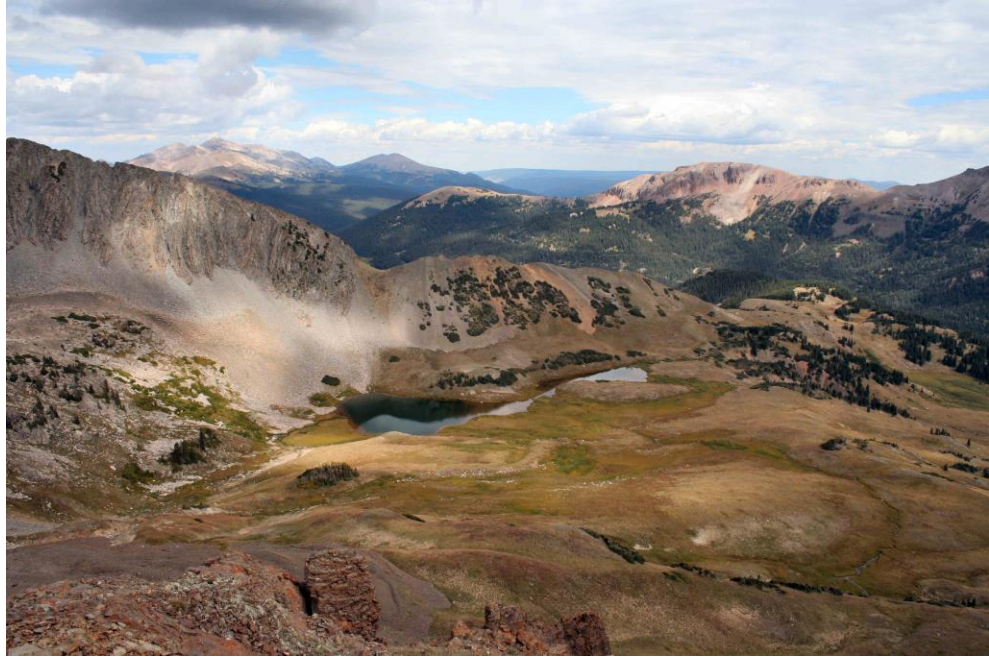
View of the American Lakes from the vicinity of Thunder Pass

Descend back to the trail junction just before the lowest lake and take the trail south towards Thunder Pass. Enjoy views of the Park before heading back down the trail.